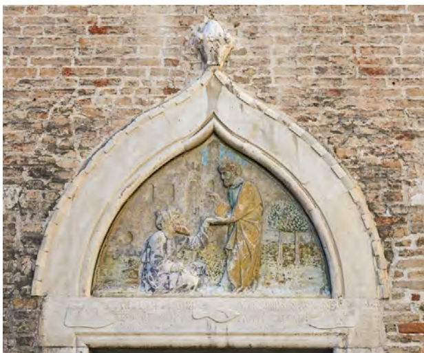
Mark healing Ananius of Alexandria (Pietro Lombardo, Venice).